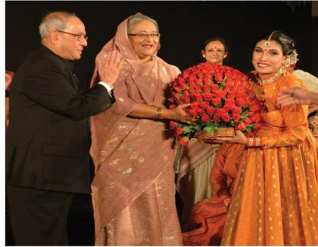
Choreographed for the State Visit of Bangladesh Prime Minister Smt Sheikh Hasina to India at Rashtrapati Bhawan in the presence of then President Shri Pranab Mukherjee, Prime Minister Shri Narendra Modi and the entire political galaxy of India.